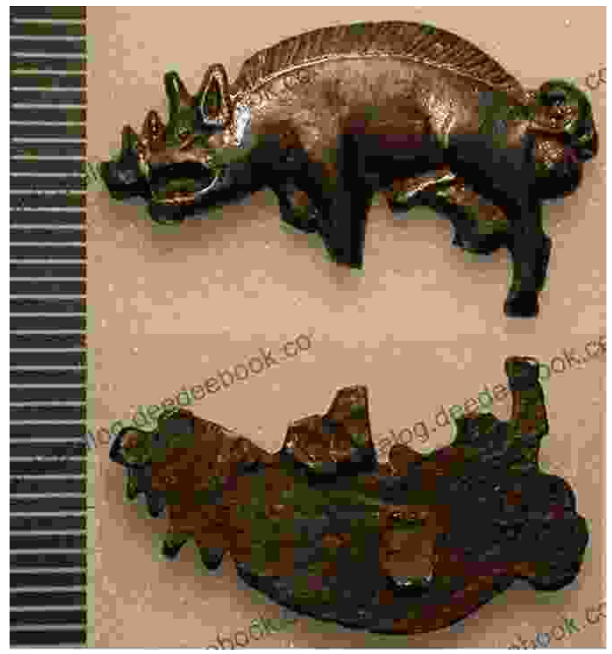
Legacy and Mission

The Order of the White Boar has played a pivotal role in countless historical events, shaping the course of nations. Its members have fought alongside kings and queens, thwarted invasions, and prevented coups. Their unwavering loyalty and exceptional skills have earned them a reputation as the most elite fighting force in the world.