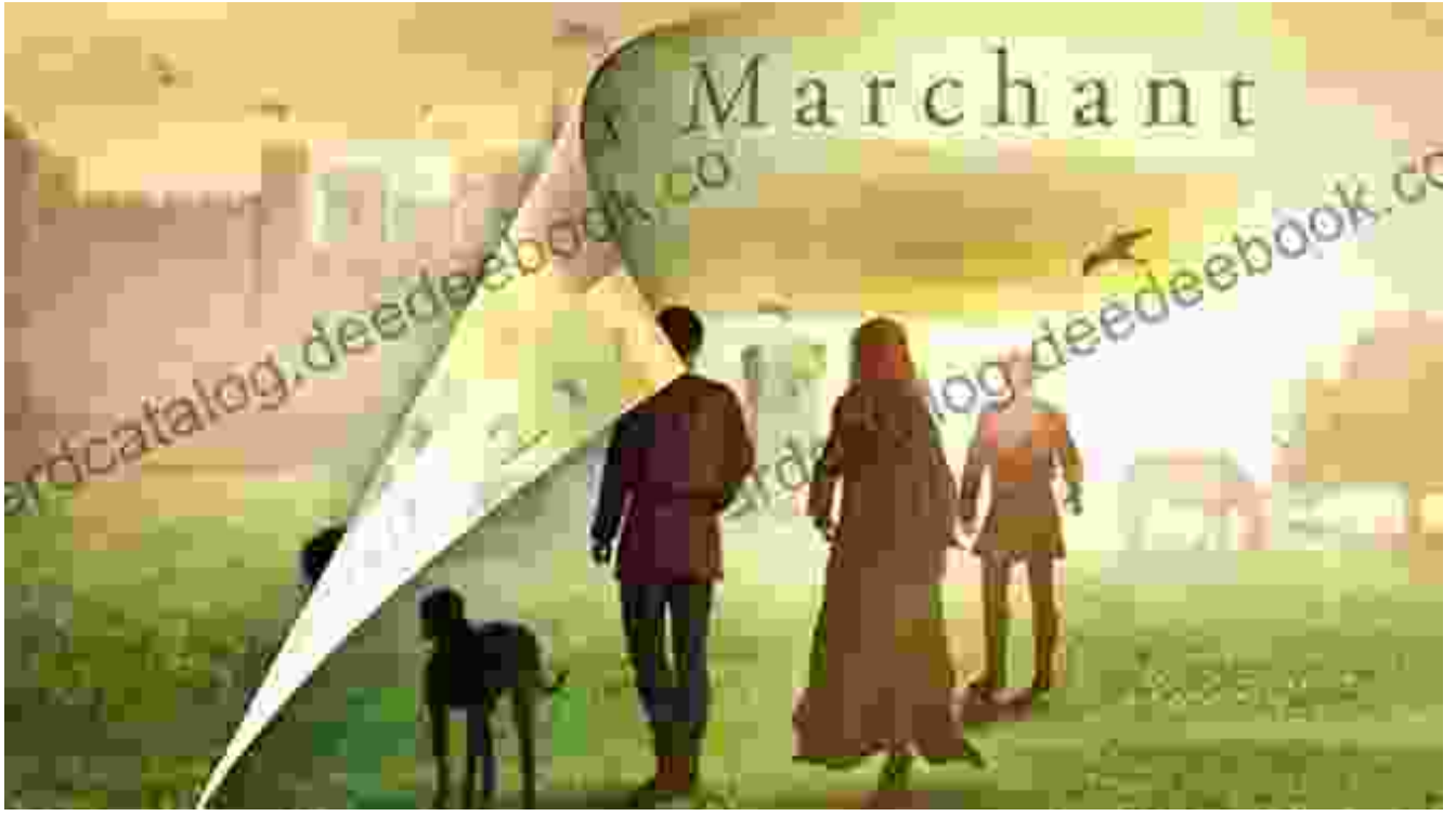
Lore and Characters

One of the Order's most effective tactics is the use of surprise attacks. They often strike at dawn or dusk, when their enemies are least expecting it. They also use their knowledge of the terrain to their advantage, ambushing their opponents in narrow passes or dense forests.