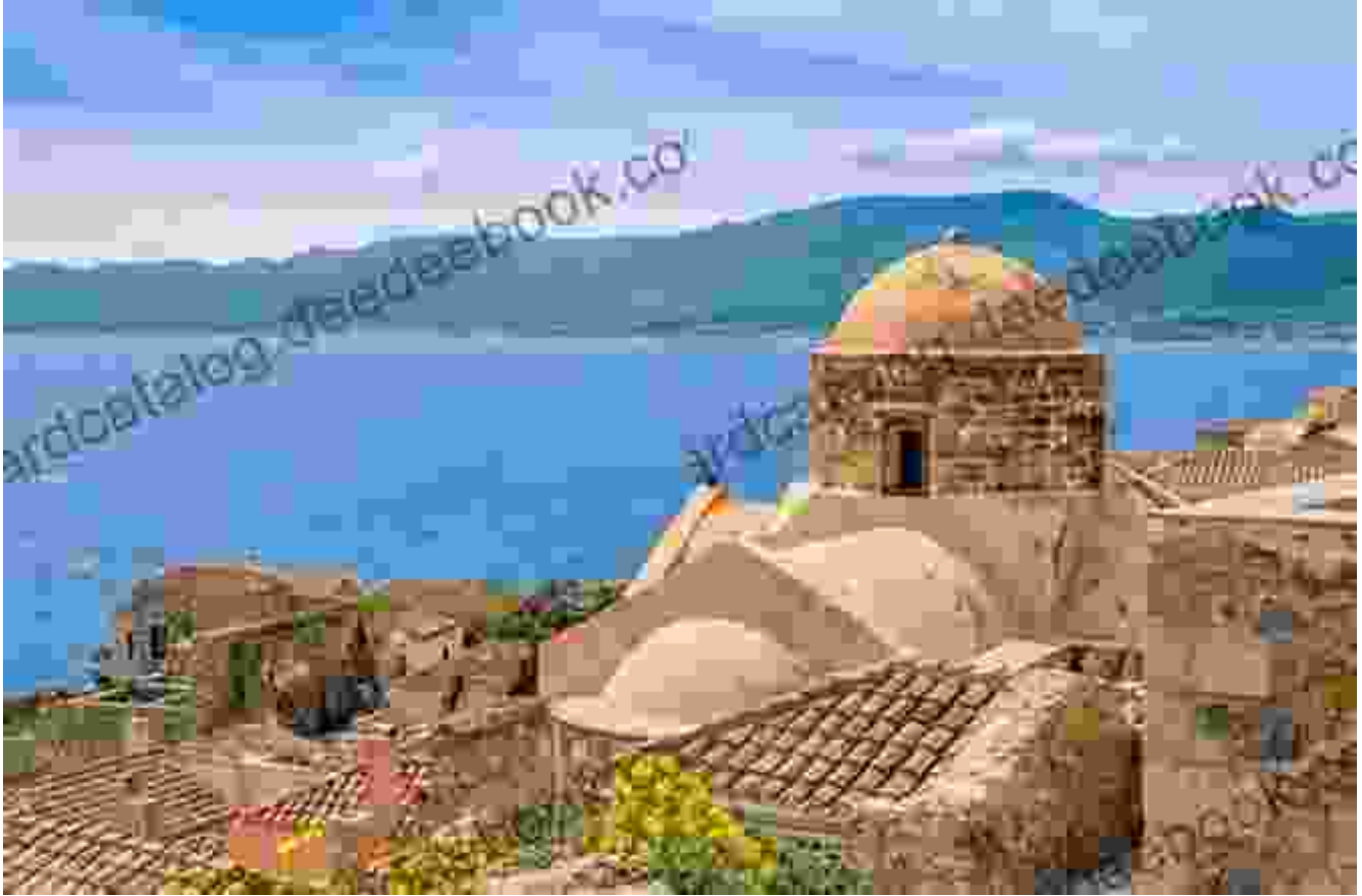
The Castle of Monemvasia