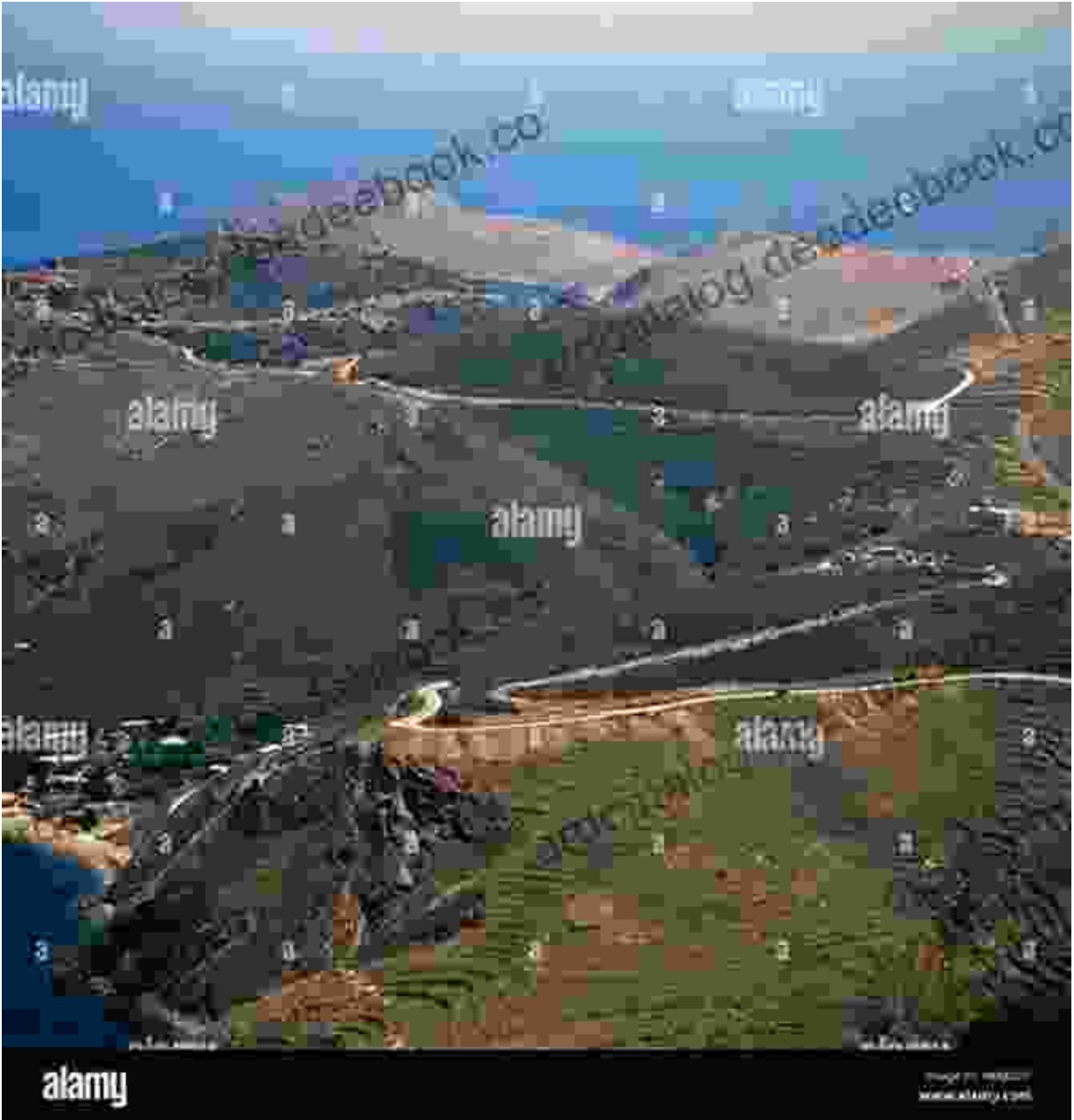
The rolling hills of the Peloponnese

The Peloponnese is a region of Greece that has something to offer everyone. With its ancient ruins, medieval castles, Venetian towns, and rolling hills, the Peloponnese is a great place to learn about history, architecture, and nature. Whether you're interested in exploring ancient