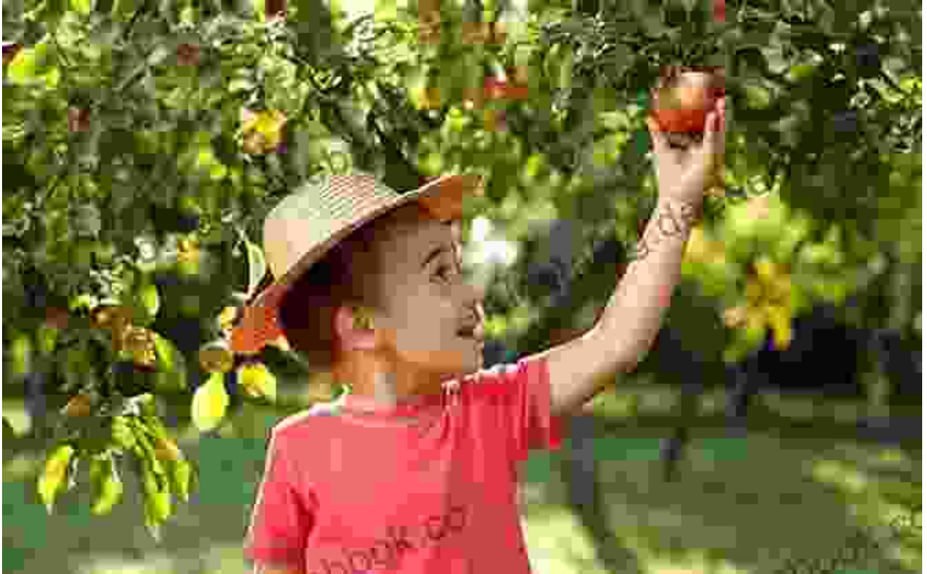
A child picking apples from a tree